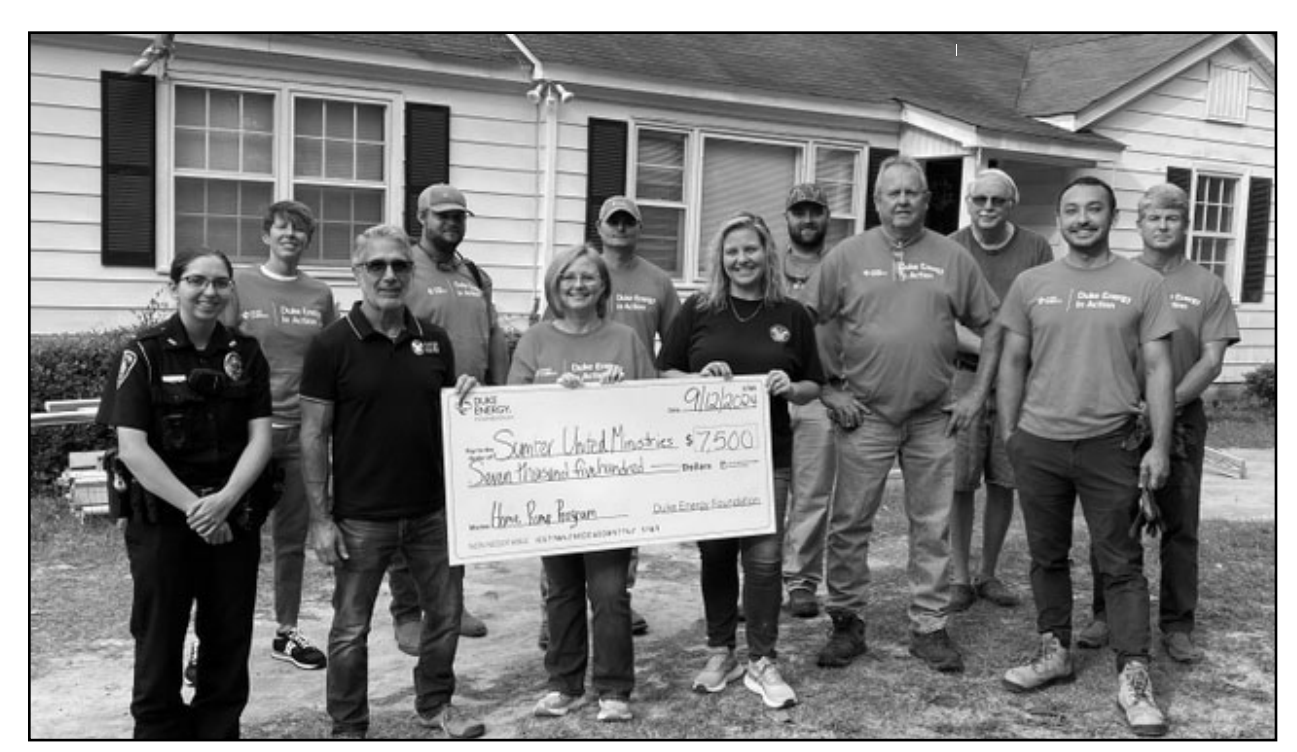
The Duke Energy Foundation is providing $100,000 in grants to 13 organizations in South Carolina to support programs that provide home ramps for low-income senior citizens.

"Safety is the most important aspect of everything we do at Duke