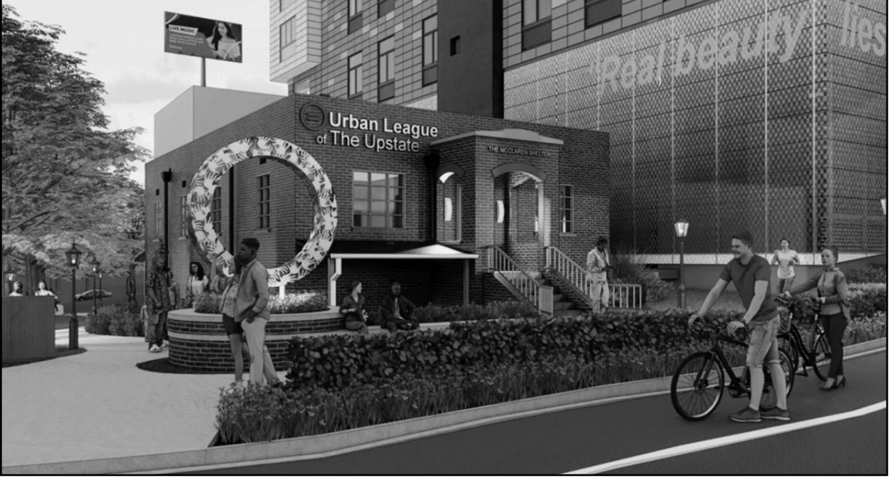
The Community Foundation of Greenville recently awarded a $25,000 grant to the Urban League of the Upstate located in Greenville.

"This gift helps us continue the work we do every day while also moving for-