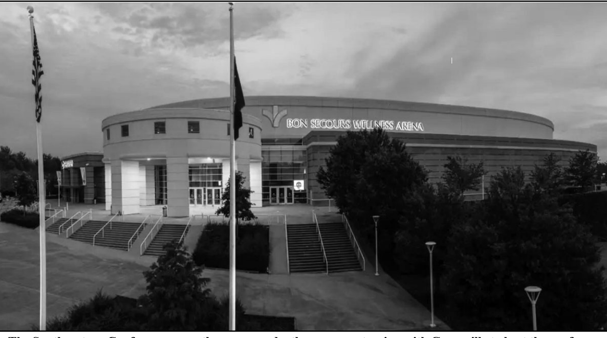
The Southeastern Conference recently announced a three-year extension with Greenville to host the conference women's basketball tournament through 2028.

SEC women's basketball student-athletes, coaches and fans."