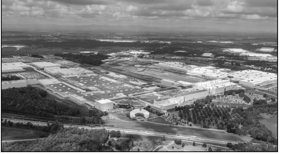
BMW Group recently announced a donation to American Red Cross for disaster relief in the aftermath of Hurricane Helene.

October is National Principals Month, and Spartanburg School District 7 would like to celebrate the capable leaders their schools. They are more than just leaders - they are visionaries who shape the future of the District's schools. Their commitment to academic excellence, community engagement, and promoting inclusivity makes a difference in the lives of students and teachers every day.