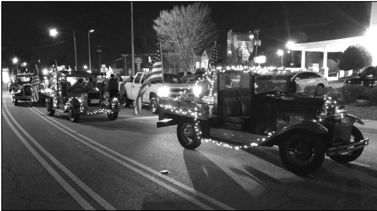
The Spartanburg Jaycees presented the 2025 Spartanburg Christmas Parade on December 9th. Since 1985, the Jaycees have organized and hosted the annual Christmas Parade for the City of Spartanburg.